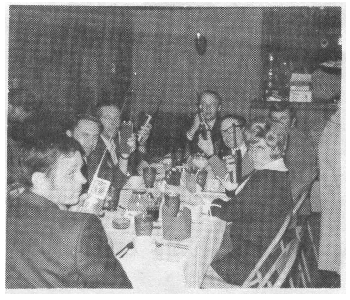
Speaking of 1980 look at the size of those HTs, no wonder their nickname was "Brick"