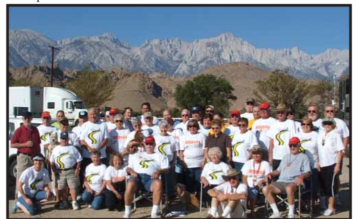
Some of the 2008 Whitney Classic workers with Mt. Whitney in the background.

Again, a few Northern California Hams helped the Southern California Sams Radio Hams provide communications for the 135 mile overnight Whitney Classic charity bike ride from Death Valley to Whitney Portal through Lone Pine.. Neither of the repeaters used were up to par, but steady improvements every year in the mobile rigs used made FM simplex communications adequate and dependable. A four-night campout followed at Boulder Creek, MVRC's favorite RV park. Next year's ride will be Sept. 28-29.