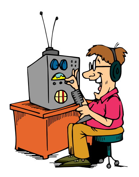
see you all at the Meeting!

SUN OCT 17 - MEETING - Suggested date so conflicts can be adjusted. Please comment!