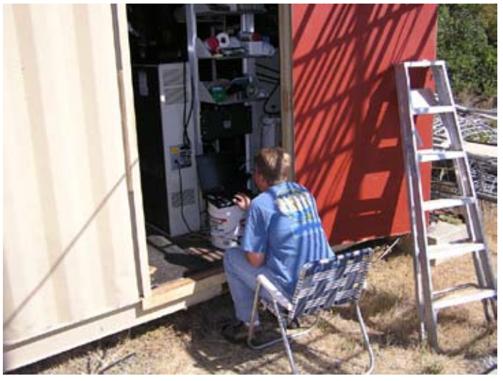
Left: our equipment with new repeater installed. Above: Marc updating controller.