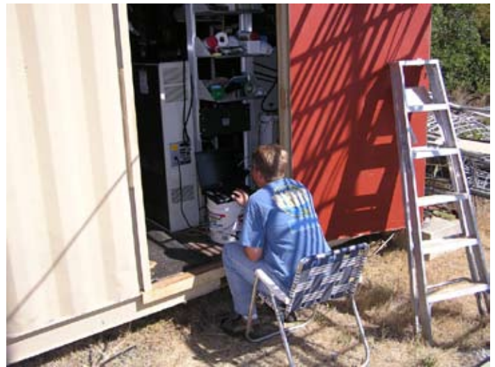
Left: our equipment with new repeater installed. Above: Marc updating controller.